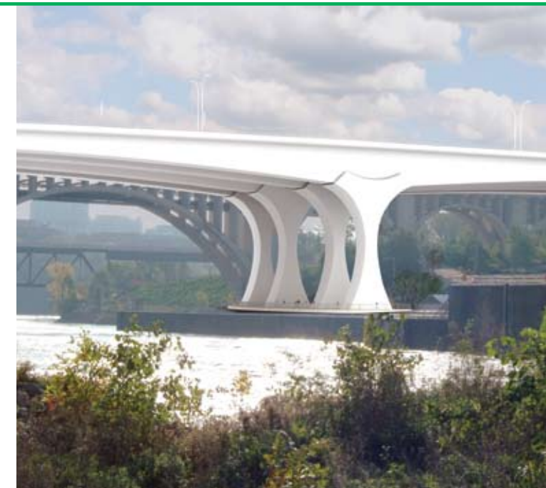
View from lower St. Anthony Falls Lock and Dam