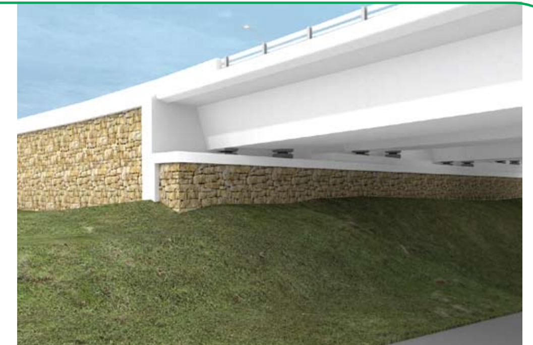
The abutments at each end of the bridge will feature native stone.