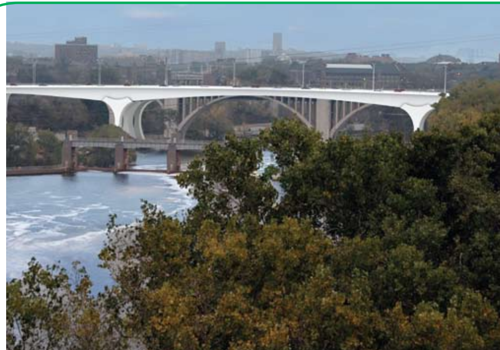
View from the cantilever of the Guthrie Theater

Meet at the corner of Washington and 19th Avenues (in front of Grandma's Saloon) every Saturday at 11 a.m. for a free Sidewalk Superintendent Talk led by project representatives who will describe the design/build process and answer questions. Everyone is welcome!